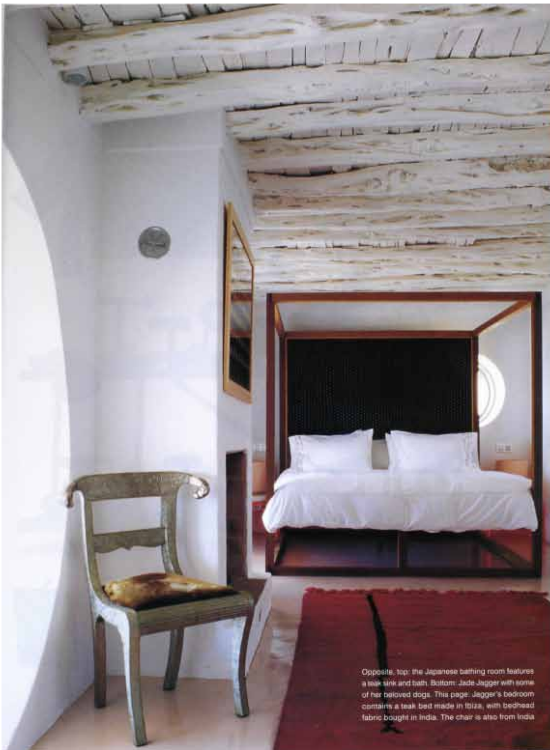
Opposite, top: the Japanese bathing room features a teak sink and bath. Bottom: Jade Jagger with some of her beloved dogs. This page: Jagger's bedroom contains a teak bed made in Ibiza, with bedhead fabric bought in India. The chair is also from India