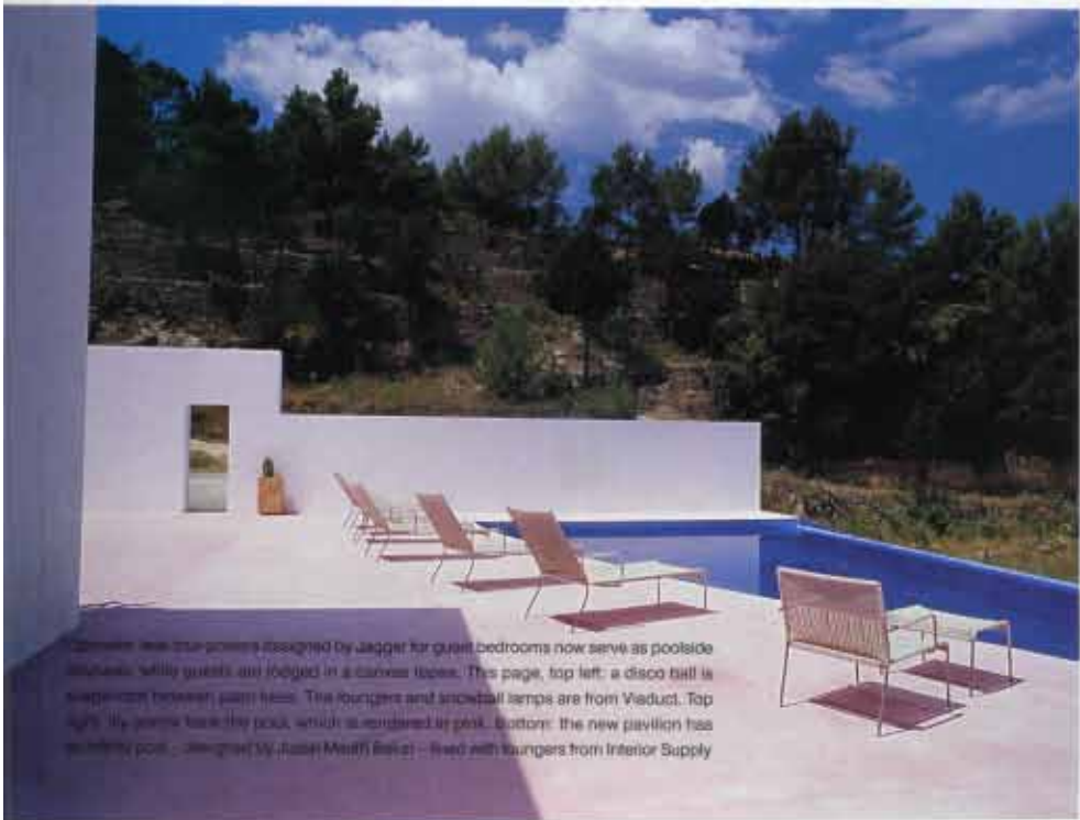
Older, less eye-popping designs by Jagger for guest bedrooms now serve as poolside lounges, while guests are lodged in a canvas box. This page, top left: a disco ball is suspended between palm trees. The loungers and snowball lamps are from Vieduct. Top right: the same back the pool, which is bordered by pink. Bottom: the new pavilion has a white pool... designed by Jason Merrill Baker — fixed with loungers from Interior Supply