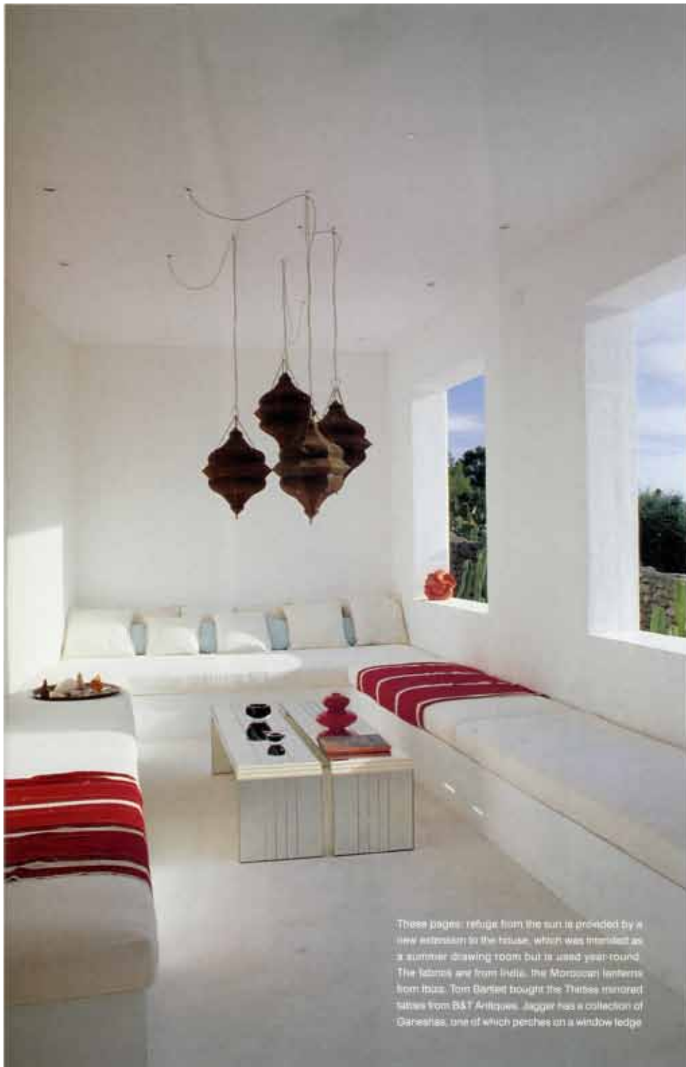
These pages: refuge from the sun is provided by a new extension to the house, which was intended as a summer drawing room but is used year-round. The lanterns are from India, the Moroccan lanterns from Ibiza. Tom Barsted bought the Tibetan restored tables from B&T Antiques. Jagger has a collection of Ganeshes, one of which perches on a window ledge